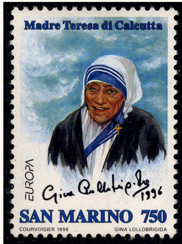
Mother Teresa by Gina Lollobrigida, San Marino, Scott 1349.

By the end of the 1970s, Lollobrigida had embarked on what she developed into a successful second career as a photographic journalist. She photographed, among others, Paul Newman, Salvador Dali, Henry Kissinger, David Cassidy, Audrey Hepburn, Ella Fitzgerald, and the Germany national football team. In 1974 she managed to obtain an exclusive interview with Cuban leader Fidel Castro. Between 1972 and 1994 she published six collections of her photographs, including the 1973 title Italia Mia.